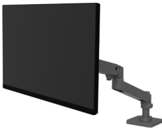
LX Pro Desk Arm