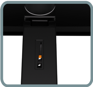
NEW TENSION INDICATOR SET TENSION LEVEL ONCE AND REPEAT FOR QUICK INSTALLATION OF MULTIPLE WORKSTATIONS