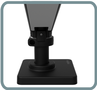
NEW ROTATION STOP PREVENT DAMAGE TO WALLS, PARTITIONS, OR CUBICLES