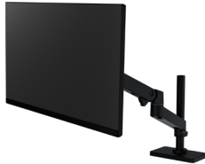
LX Pro Desk Arm, Tall Pole