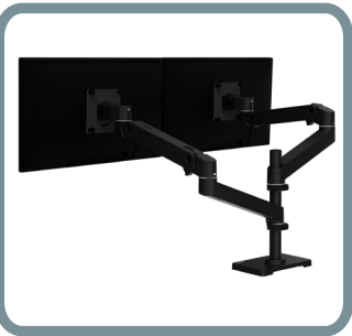
ADD AN ARM (SINGLE TO DUAL)