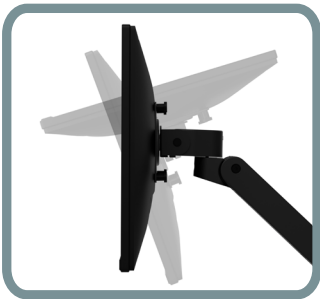
INCREASED TILT RANGE BETTER ERGONOMICS FOR USERS