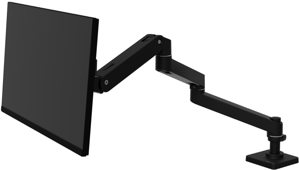
MONITOR ARM EXTENSION