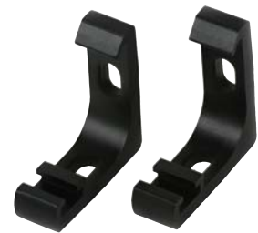
Standard Wall/Ceiling Brackets

Optional Elite ZR800D Universal Learning Remote Control, allows one-touch regulation over your entertainment system managing up to 8 devices simultaneously. Each unit has a simplified programming option with learning function to accompany 800 pre-programmed TV/DVD/VCR codes.